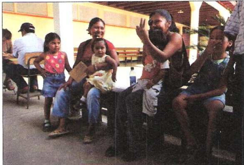
Patients wait to be seen at a Catholic sisters' clinic in the town of Cantabal.